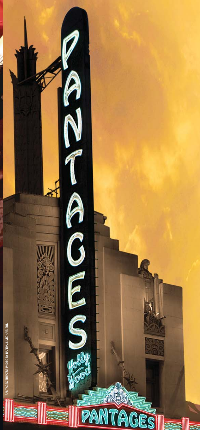
PANTAGES THEATRE